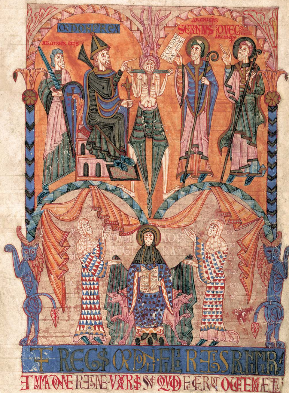
Testament of Ordoño I, f. 8v